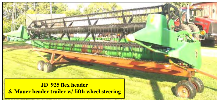
JD 925 flex header & Mauer header trailer w/ fifth wheel steering