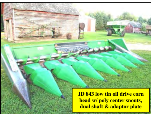
JD 843 low tin oil drive corn head w/ poly center snouts, dual shaft & adaptor plate