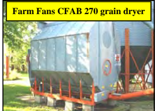
Farm Fans CFAB 270 grain dryer