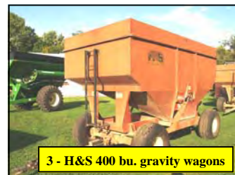
3 - H&S 400 bu. gravity wagons