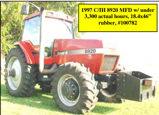
1997 C/IH 8920 MFD w/ under 3,300 actual hours, 18.4x46" rubber, #100782