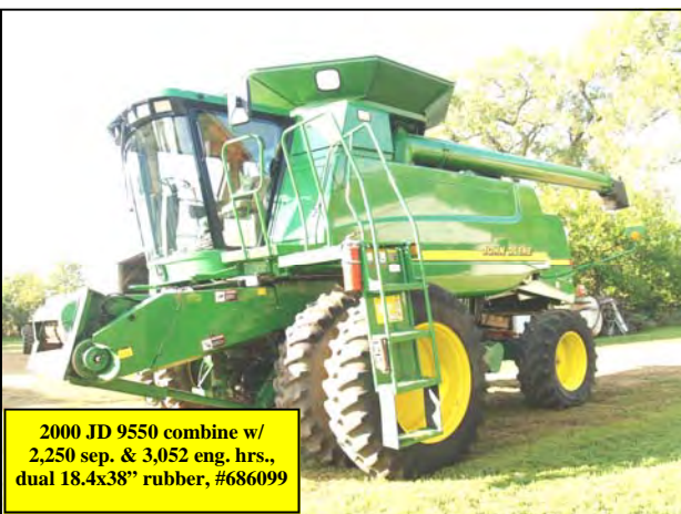
2000 JD 9550 combine w/ 2,250 sep. & 3,052 eng. hrs., dual 18.4x38" rubber, #686099