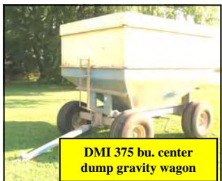
DMI 375 bu. center dump gravity wagon