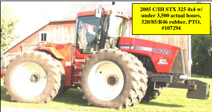
2005 C/IH STX 325 4x4 w/ under 3,500 actual hours, 520/85/R46 rubber, PTO, #107294