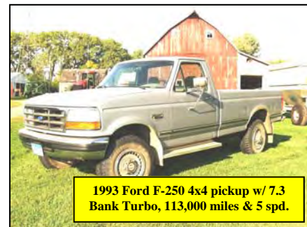
1993 Ford F-250 4x4 pickup w/ 7.3 Bank Turbo, 113,000 miles & 5 spd.