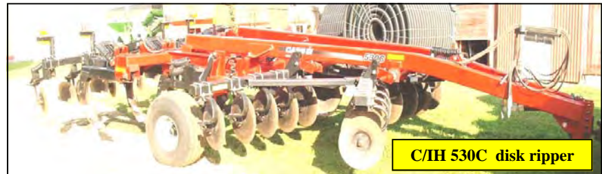
C/IH 530C disk ripper