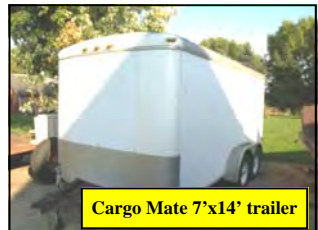
Cargo Mate 7'x14' trailer