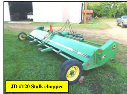
JD #120 Stalk chopper