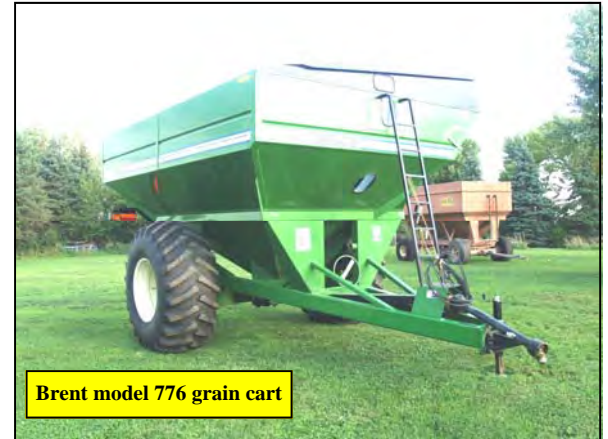
Brent model 776 grain cart